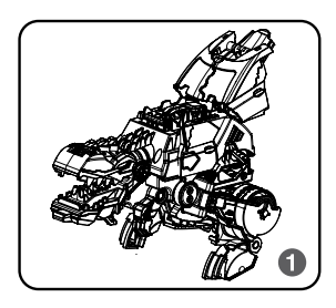
1. Dino mode.