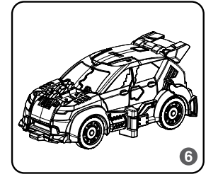
6. Vehicle mode.

Note: To switch from Vehicle mode to Dino mode, follow the above steps in reverse order.