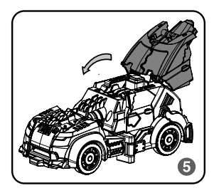
5. Swing the windshield forward as illustrated.