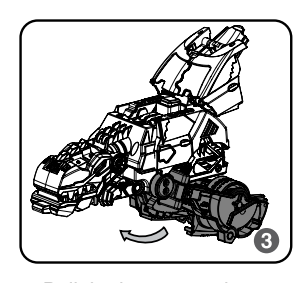
3. Pull the legs up and toward the dino's body as illustrated.