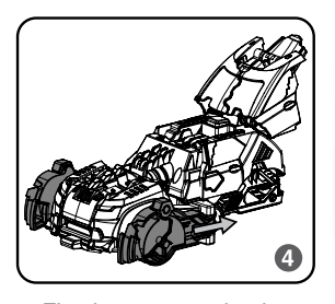
4. Flip the rear tires back as illustrated.